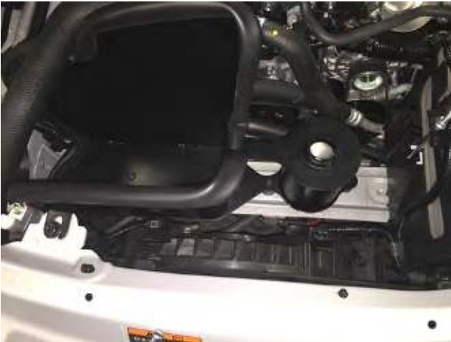
c. Install the complete heat shield assembly into the engine compartment as shown and secure with supplied hardware.