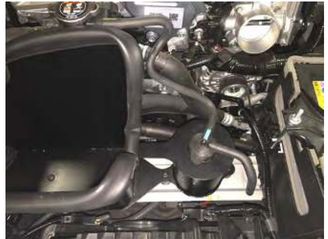
d. Transfer the coolant from the factory tank into the AEM reservoir and seal with factory cap. The capacity of the AEM reservoir is different from the factory reservoir but it does not affect the functionality.