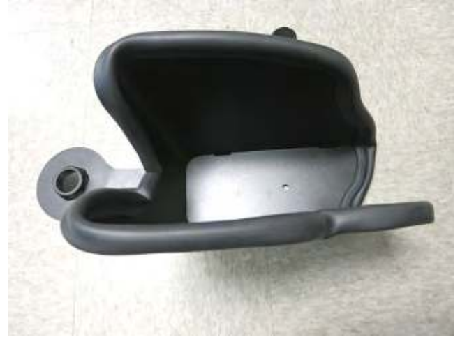
b. Install the supplied rubber edge trim onto the AEM heat shield assembly as shown.