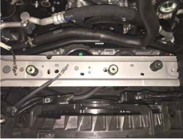
a. Install the supplied rubber isolator mounts into the engine compartment as shown.